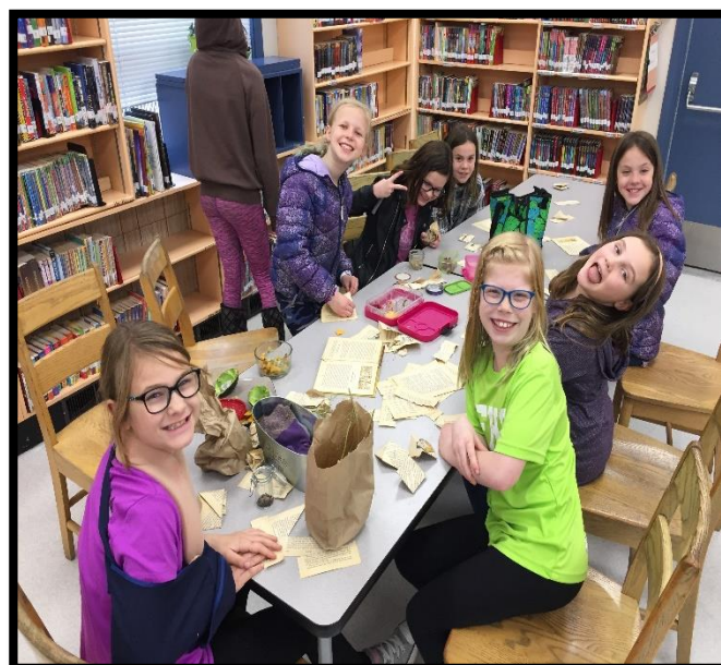
Our last garden club meeting until the spring. Students created seed packets and took some seeds home for their own gardens.