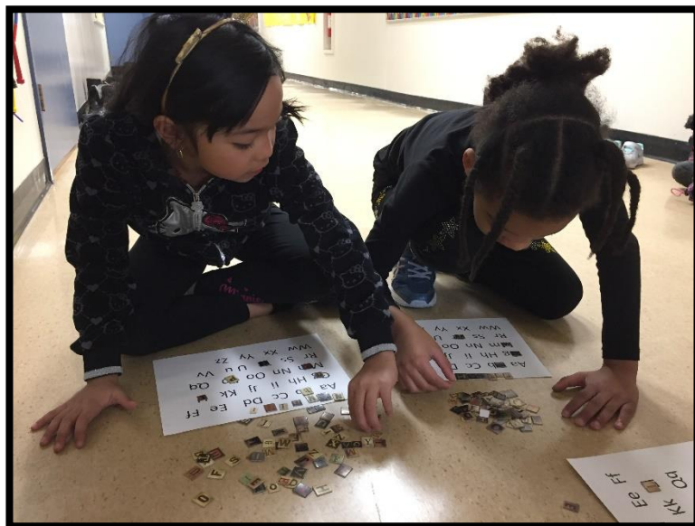
Students in Mme. Grant's class learning about French sounds.