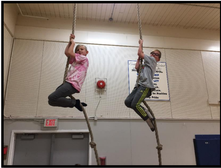
Two students from Mme. Ingrid's class proud of their accomplishment of getting to the top of the rope.